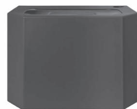
PE Water container - black