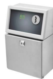
Token timer CM 100