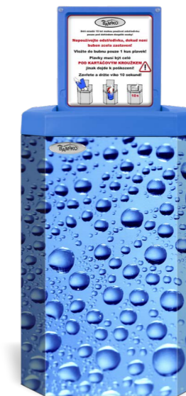
3 Water droplets