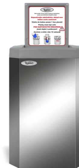
7 Stainless steel