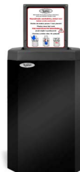
10 Matte black 9005