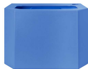
PE Water container - blue