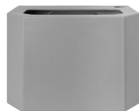
PE Water container - grey