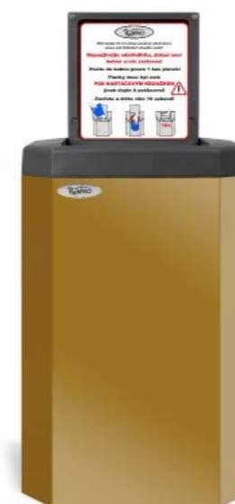
9 Deep bronze