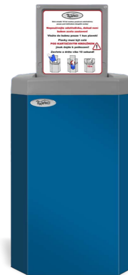
1 Blue RAL 5017