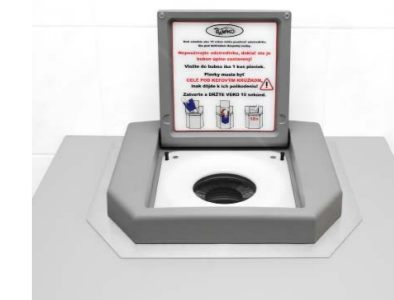
Counter top edition blue / grey / black plastic stainless steel frame