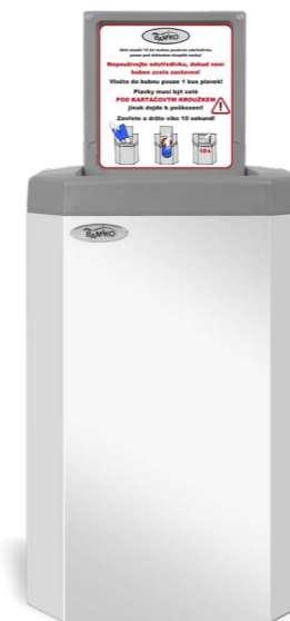
5 White RAL 9003